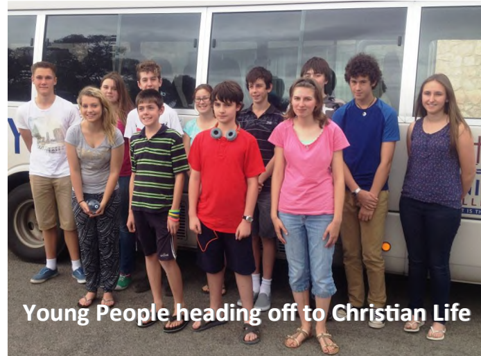
Young People heading off to Christian Life