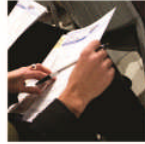
You can fill in a paper form