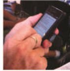
OR BYO smart device to do the survey online