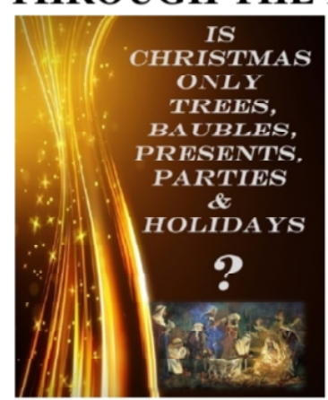
IS CHRISTMAS ONLY - PT.1