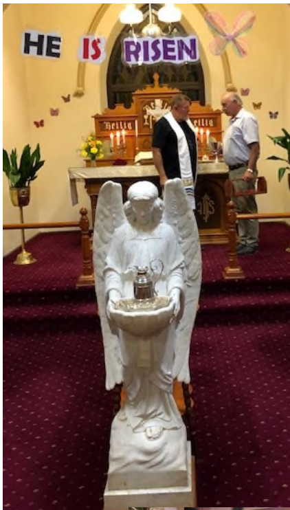
The Monarto Congregation Flowers at Holy Cross Christ Church Worship site